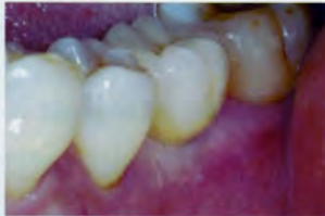
• Molar tooth after the treatment