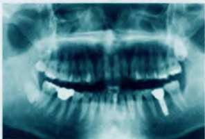
• Radiograph after the treatment