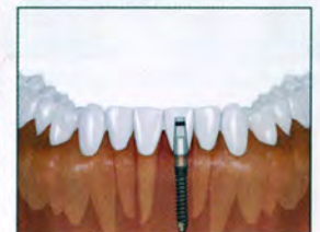
Implant for the narrow gap between teeth