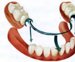
Removable Partial Denture