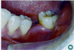
• Molar tooth before the treatment